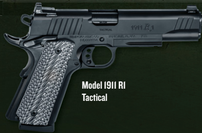
Model 1911 RI Tactical

CASH BACK BY MAIL WITH THE PURCHASE OF ANY 1911, RP9, R51 OR RM380 HANDGUN. May 15 - July 30, 2017 (All requests must be postmarked by 8/30/17)